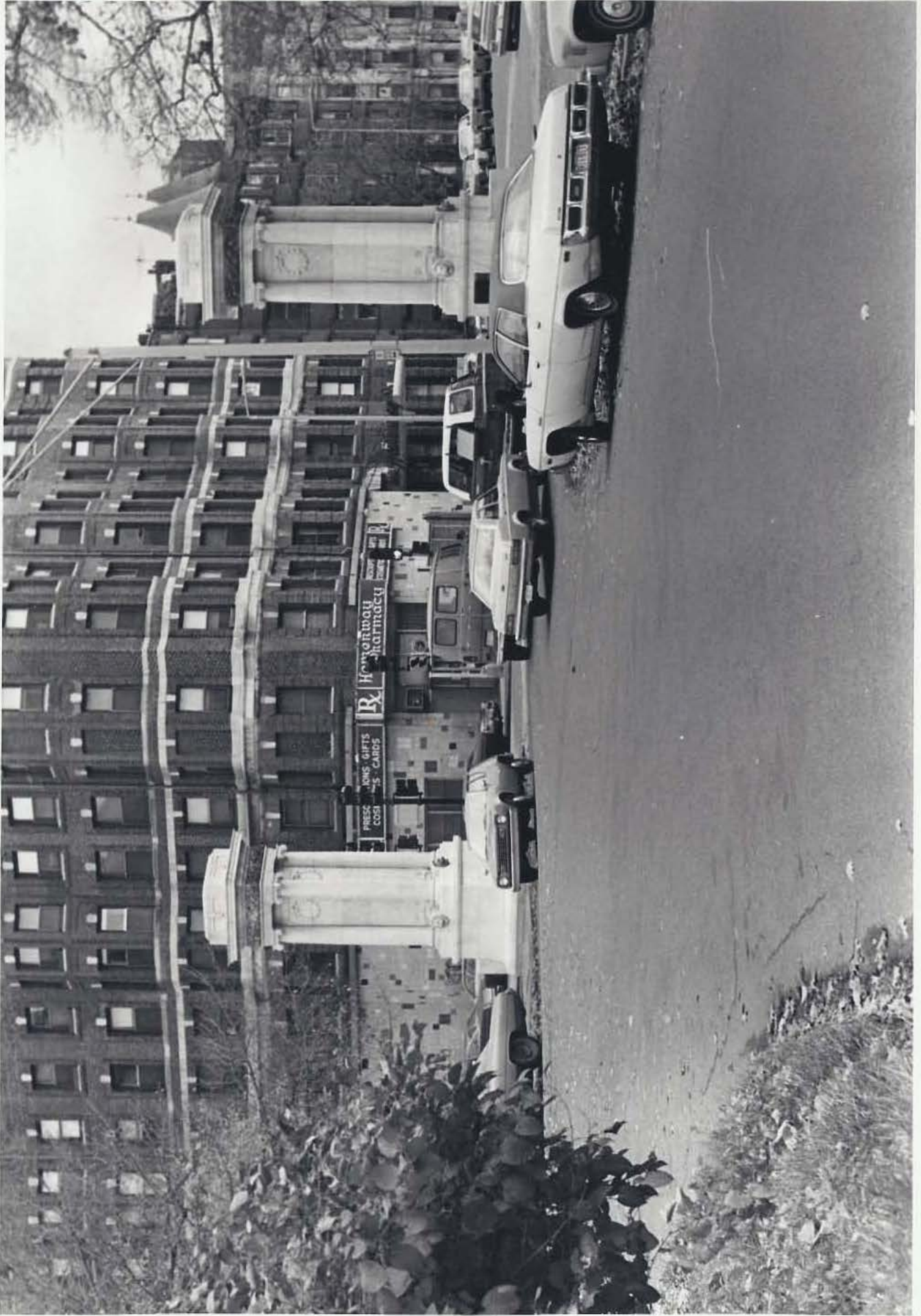
Johnson Memorial, Westland Avenue Entrance.