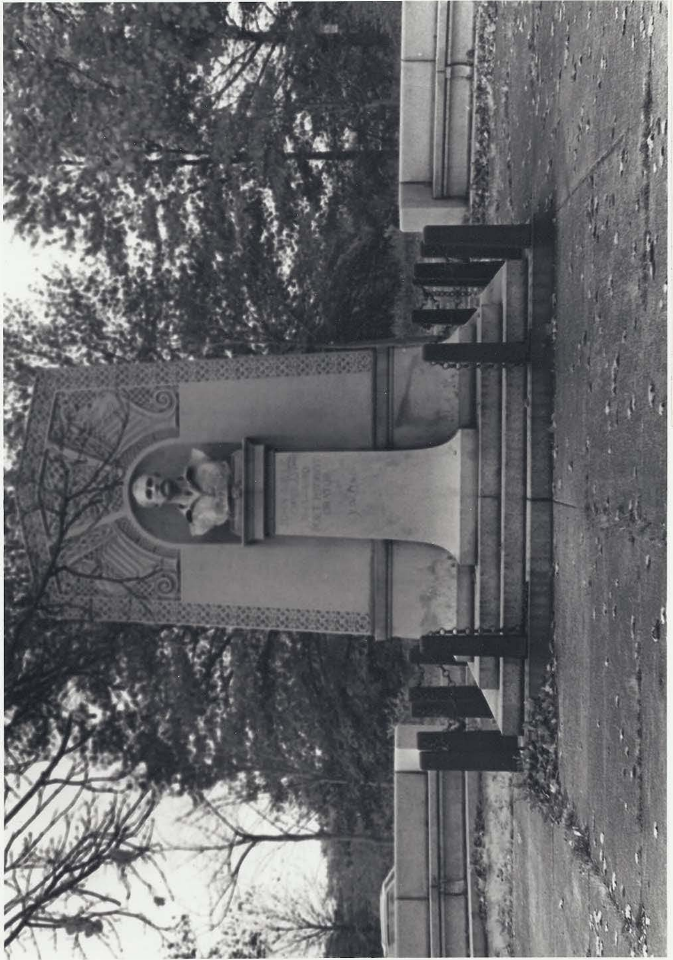
John Boyle O'Reilly Memorial prior to relocation.