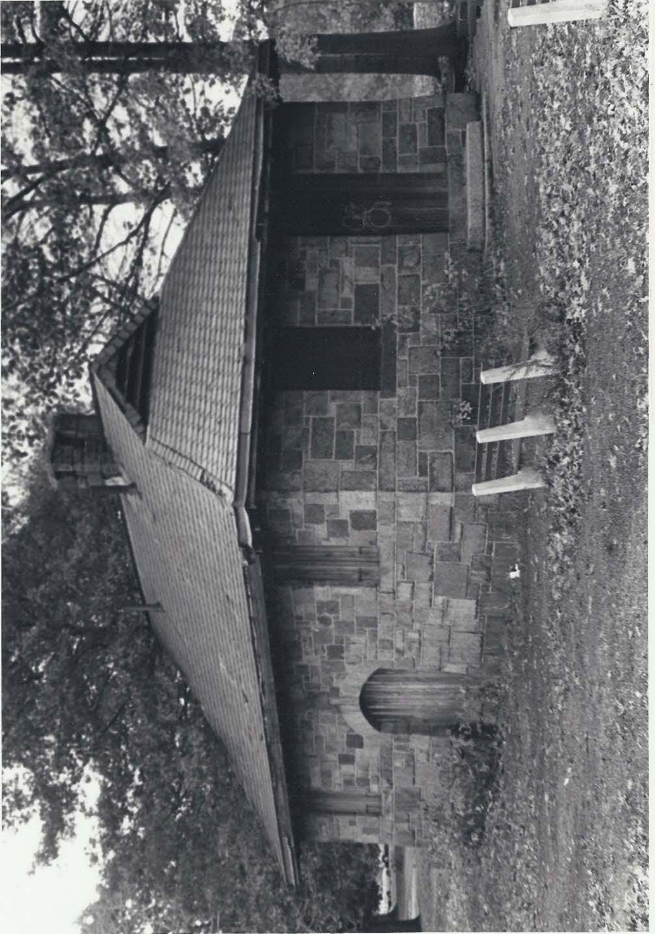
1906 stone restroom, north of Agassiz Bridge.