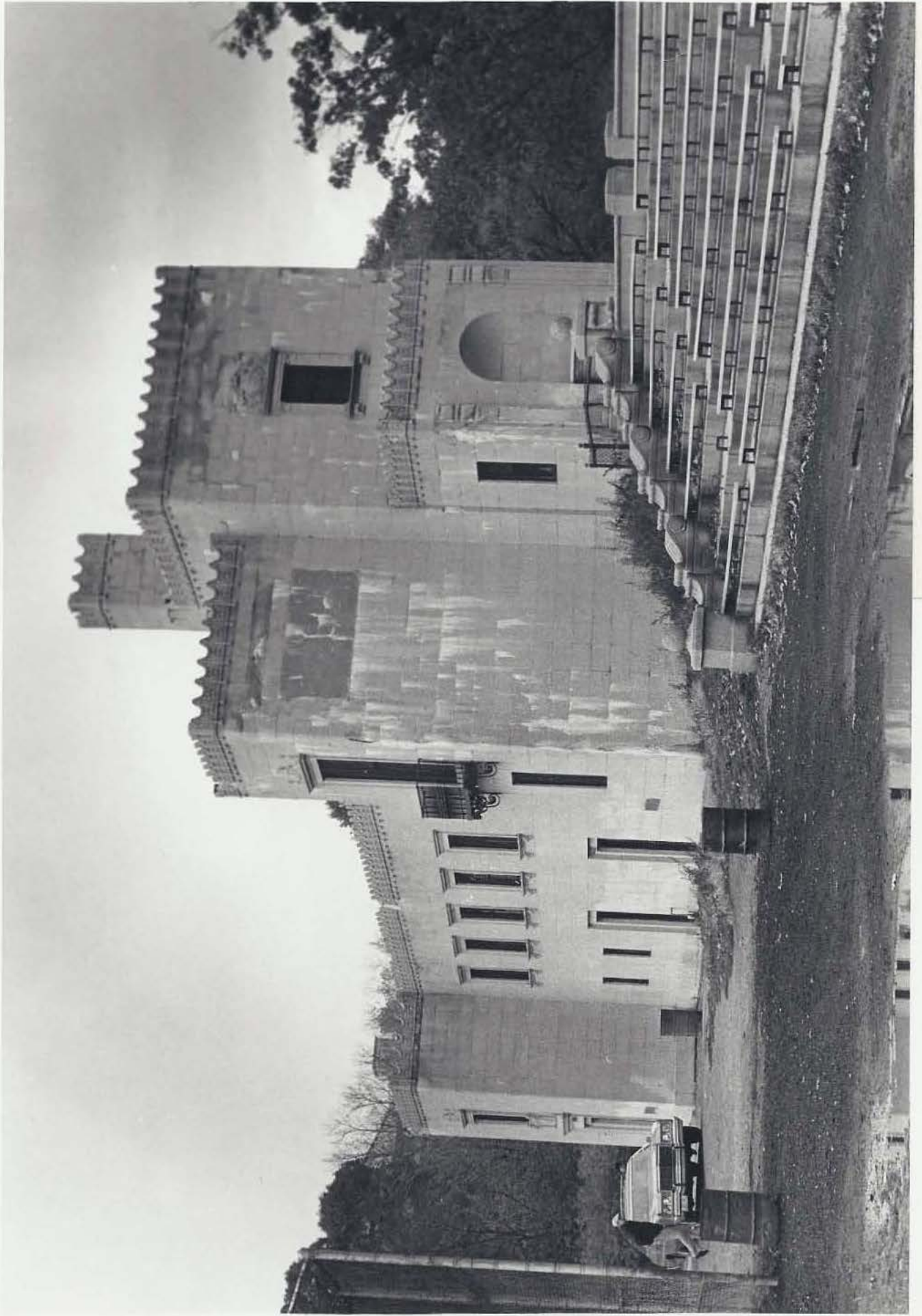
Fieldhouse and bleachers, Roberto Clemente Field