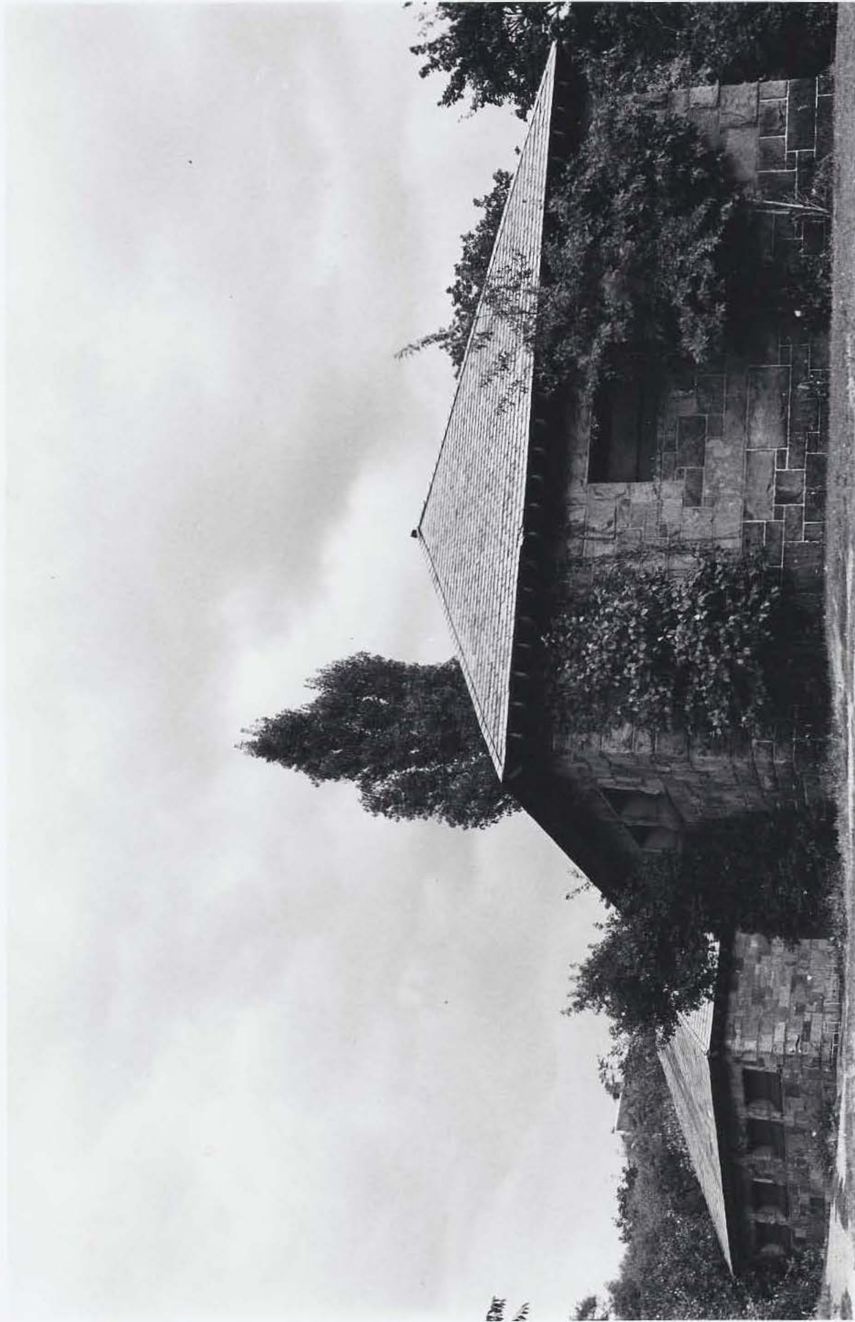
Gatehouse #1 in foreground, Gatehouse #2 in rear