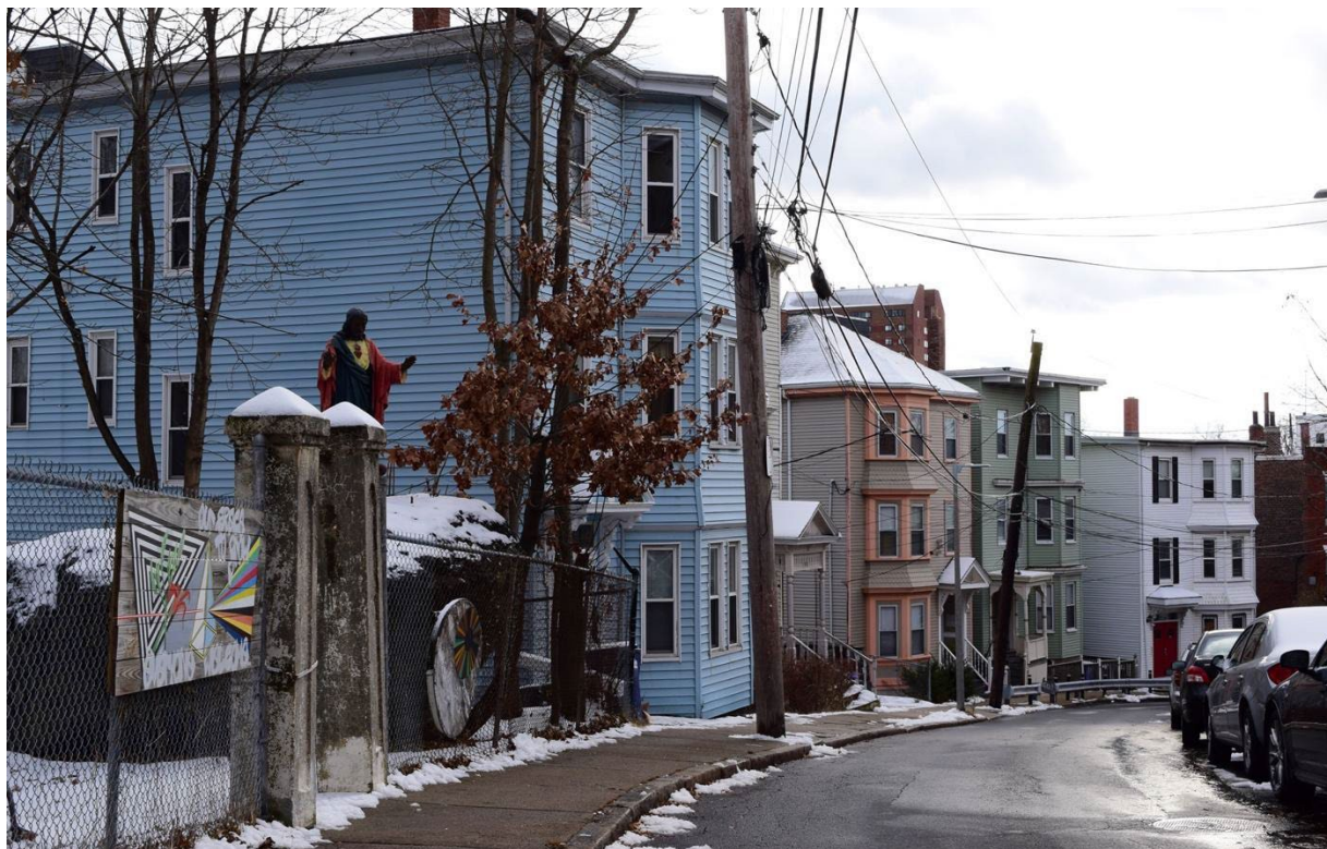
Figure 12: (L to R) The Black Jesus statue and 188, 190, 194, 196, 198 and 200 Highland Street, looking southeast.

Examples of three-deckers in the district include the buildings at 101 and 103 Highland Street (ca. 1884-1895, BOS.12037) which have Queen Anne-style turrets enclosing one corner; 64 Lambert Avenue (ca. 1884-1895, BOS.12116) which has lunette and oval windows; 77 Marcella Street (ca. 1884-1890, BOS.12171) which has a distinctive ovolo cornice; 133 Thornton Street (ca. 1899-1906, BOS.12581) with its classically-inspired cornices and window lintels; 52 Lambert Avenue (1896, BOS.12115) with an arched, recessed entrance and two-story porch supported by Tuscan columns; 16-18 Oakland Street (ca. 1884-1895, BOS.12222) with wood sunburst motifs above the windows; and 41 Dorr Street (1894, BOS.12657) with its guilloche tower entablature and swan's neck gable. Less ornate three-deckers are found on numerous streets in the district, including the south end of Highland Street, (ex. 188 Highland Street, 1890, BOS.12073 , Figure 12), the south side of Beech Glen Street (ex. 53 Beech Glen Street, 1890, BOS.11879 , Figure 13), Lambert Avenue (ex. 27 Lambert Avenue, 1896, BOS.12110 , Figure 14), Lambert Street (ex. 13-15 Lambert Street, 1891, BOS.12119 , Figure 15), and Thornton Street (ex. 112 Thornton Street, 1905, BOS.12595 , Figure 16).