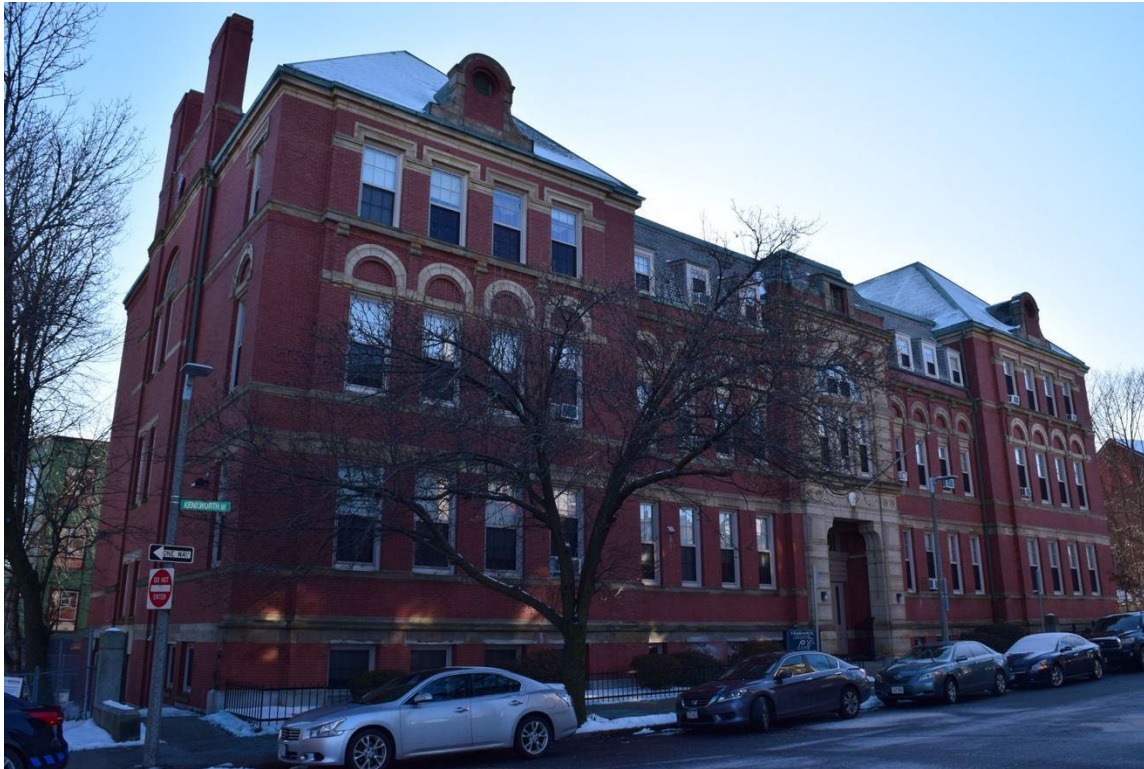
Figure 20: The former Dillaway School at 6 Kenilworth Street, looking southeast.

Another form of multiple-family housing in Highland Park is found in converted buildings, both single-family houses, like the Queen Anne-style house at 21 Highland Street (1886, BOS.12031) and the former Louis Prang Chromolithograph Factory, 270–286 Roxbury Street (1867, BOS.11988, 12256) , which was converted into apartments in the 1980s. The Dillaway School, 6–8 Kenilworth Street (1882, BOS.12102, Figure 20) was converted into apartments in 1978.