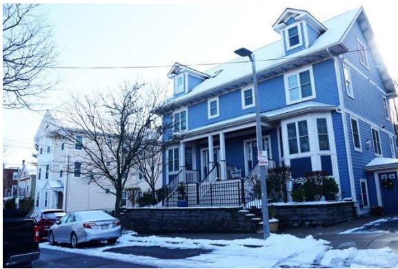
Figure 15: (R to L) 7, 9, 13 and 15 Lambert Street, looking southeast.