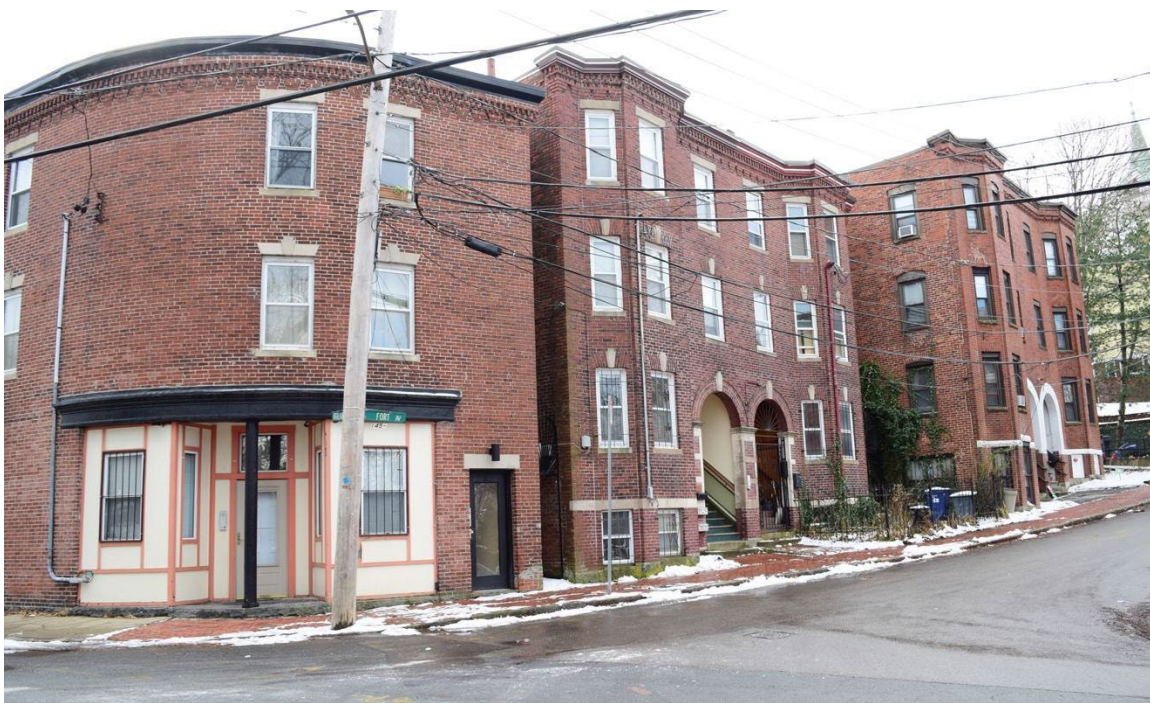
Figure 19: (L to R) 145 and 147 Highland Street and 4, 6, 8 and 10 Fort Avenue, looking southwest.