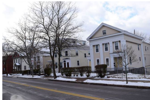
Figure 8: (R to L) 111, 117, 121, 123 and 125 Centre Street, looking southwest.

The Gothic Revival style, influenced by the work of architects and landscape designers Andrew Jackson Downing (1815–1852) and Alexander Jackson Davis (1803–1892), is found in only a small number of buildings in Highland Park which were constructed between ca. 1846 and 1858. These houses exhibit varying levels of ornamentation from the relatively restrained 108 Highland Street (ca. 1848, BOS.12065) with bargeboards in the gable peak, to the more ornate house at 54 Cedar Street (by 1852, BOS.11912) with bargeboards, window hoods, and a scrollwork entablature. (See section 3.4.1 of this report for additional discussion of the architectural significance of these houses.) An unusual example of a house constructed of native Roxbury puddingstone is the Gothic Revival stone cottage at 34 Lambert Street (ca. 1846, BOS.12126) , constructed by Nathaniel Dorr. The Gothic Revival homes of Highland Park were among the earliest Gothic Revival structures ever built in this country and they served as prototypes for others elsewhere.