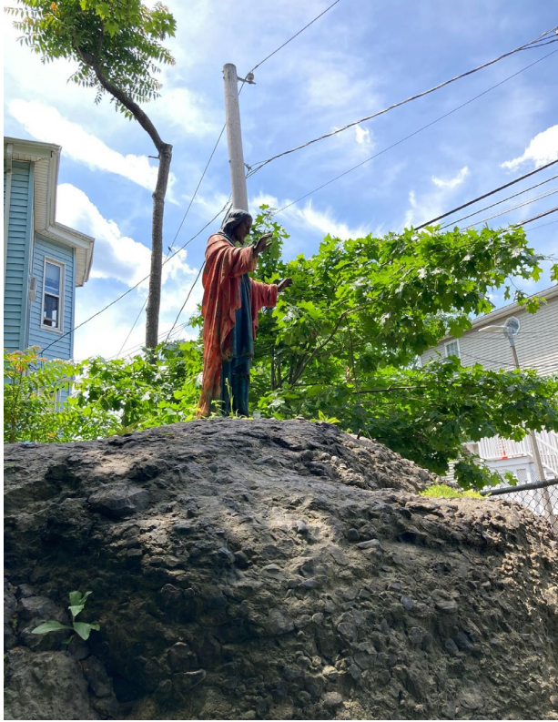
Figure 47: The Black Jesus statue, a local landmark, stands atop an outcropping of Roxbury puddingstone.

Puddingstone was also used for the foundations of some houses, including the Alvah Kittredge House.