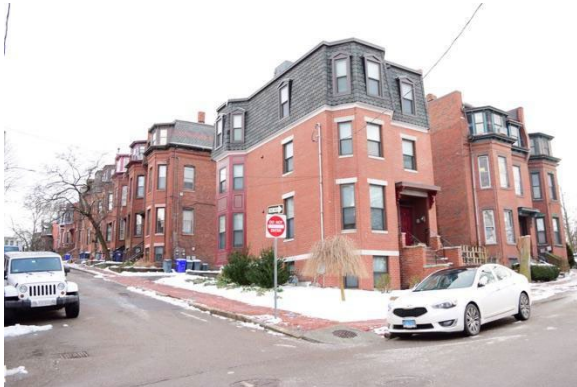
Figure 38: (L to R) 17, 15, 13, 11, 9, 7, and 5 Highland Park Avenue and 85, 83 and 81 Fort Avenue, looking southeast.

Streets near the center of the district, particularly in proximity to Highland Park, have a mix of wood-frame houses set back from the street edge, some on relatively large lots with yards, and brick row houses near the street edge, with small areas of associated landscaping. Streets immediately adjacent to Highland Park – Highland Park and Beech Glen Streets and Highland Park and Fort Avenues – have red brick sidewalks, as opposed to the concrete which is prevalent throughout the remainder of the district. Several streets, like Morley, Fort (Figure 38), Cedar (Figure 11), Beech Glen, and Linwood (Figure 39) Streets and Highland (Figure 40) and Highland Park (Figure 38) Avenues are lined on one or both sides with brick row houses set close to the street edge.