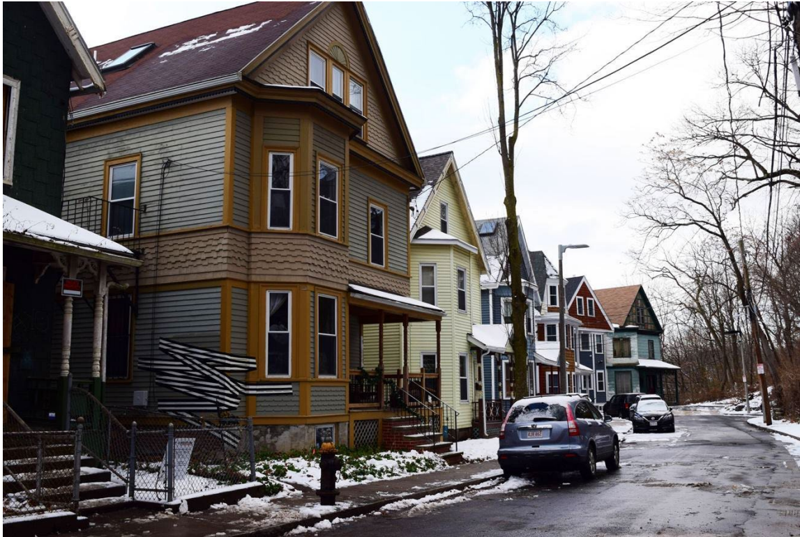
Figure 10: (L to R) 12, 14, 16, 18, 20, 22, and 24 Thwing Street, looking west.

The district contains a few examples of buildings constructed in the Shingle Style, which are identifiable by their irregular massing and roofline, use of shaped and square shingles as wall coverings, and, often, eyebrow dormers. An intact example of the style is at 6 Ellis Street (1884–1886, BOS.11969) ; others, at 40 Linwood Street (by 1873, BOS.12141) and 21 Highland Street (1886, BOS.12031) are in fair condition due to alterations and, in some cases, deferred maintenance; 21 Highland Street has been converted into a two-family residence.