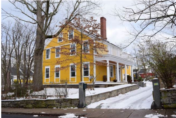
Figure 5: 140 Highland Street, looking northeast.

F. Copeland House, 140 Highland Street (ca. 1828, BOS.12069, Figure 5) , which has a side-gable roof, side-hall plan, and enclosed gables. The house at 1 Cedar Square (1840, BOS.11890, Figure 6) is an example of a center-entry house with a side-gable roof, pilasters, and enclosed gables. The Alvah Kittredge House, 10 Linwood Street (1834, NRIND, BOS.12139, Figure 7) , and the Edward Everett Hale House, 12 Morley Street (1841, NRIND, BOS.12209) are both examples of ornate temple-front houses, while more modest examples of the style can be found on Cedar, Kenilworth, Centre, Millmont, Dudley, and Ellis Streets and Highland Avenue, such as those at 111, 117, 121, and 123 Centre Street (1849–1850, BOS.11942, x, 12652, 12653, Figure 8) .