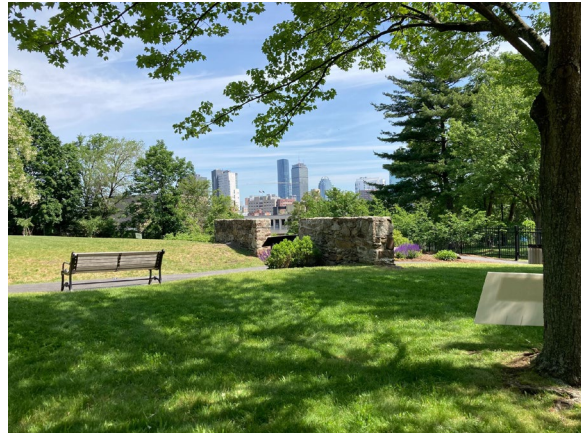
Figure 46: Views extend from Doris Tillman Playground out to Dorchester Heights (L) and Roxbury Heritage State Park out to downtown Boston (R).