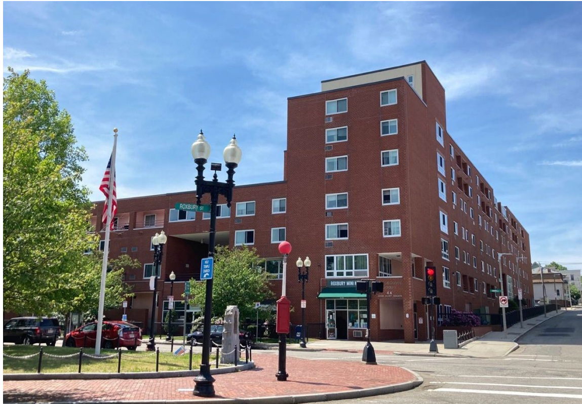
Figure 34: Marcus Garvey Gardens (44 John Eliot Square), looking southeast.

Along the outer edges of the district, particularly in the north near John Eliot Square and Nubian Square, are larger buildings, which again are generally compatible with surrounding buildings in massing and scale. An example of this is Marcus Garvey Gardens, 44 John Eliot Square (1980, BOS.12080 , Figure 34), a modernist, four-to-six story, U-shaped brick apartment building constructed by the Roxbury Action Program as affordable housing for the elderly, disabled, and families. The Marcus Garvey Gardens are a Stull & Lee design clearly influenced by the work of Aldo Rossi. The Bryant School across Malcolm X Boulevard from the district is a major Marcel Breuer commission.