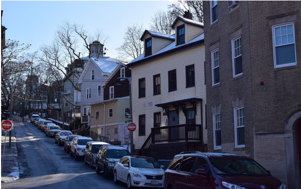
Figure 17: (L to R) 47 Centre Street, 12, 16-18, and 24-26 Gardner Street, and 288 Roxbury Street, looking south.

Bow-front row houses in the district were generally two to four bays wide and two to four stories tall, and were constructed in a variety of revival styles, with dentiled or corbelled cornices; often with recessed Greek crosses; and splayed lintels often of limestone or cast stone over windows and doors. These were built as single-family homes, many of which have been converted to multiple. Examples in the district can be found at 40-52 Guild Street (ca. 1884-1895, BOS.11995, 11996) constructed in an Italianate style, 15-21 Kenilworth Street (1887, BOS.12100) in a Romanesque Revival style with brownstone and detailed cornices, and 38-44 Kenilworth Street (1895, BOS.12105) , which is a simpler later insertion on what had been the site of a single-family home (these row houses were later renovated by the Roxbury Action Program). The tall houses facing Highland Park on Fort Ave were all built as single-family residences that were later divided into many units. Nonetheless, many instances of row houses still configured for single-family residence are still present in the neighborhood, including 21 Kenilworth Street, 53 and 59 Dudley Street, 57 Fort Avenue, and 81 Fort Avenue.