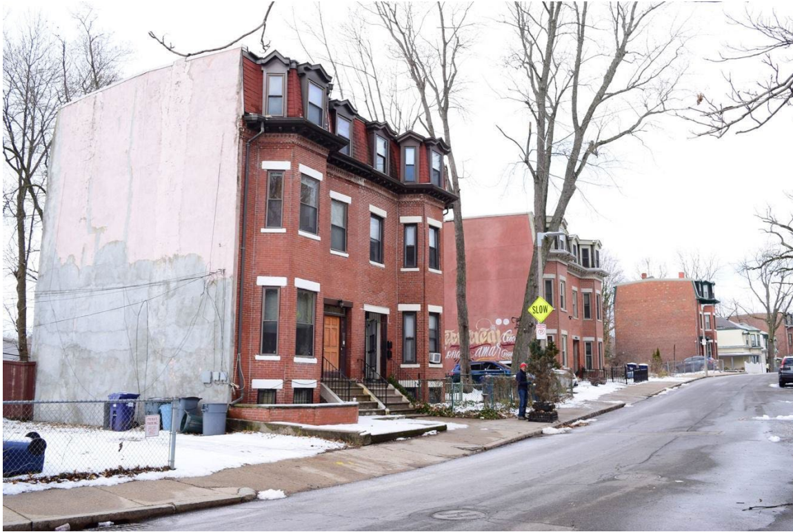
Figure 41: (R to L) 94, 96, 102, 104, 116 and 124 Marcella Street, looking west.