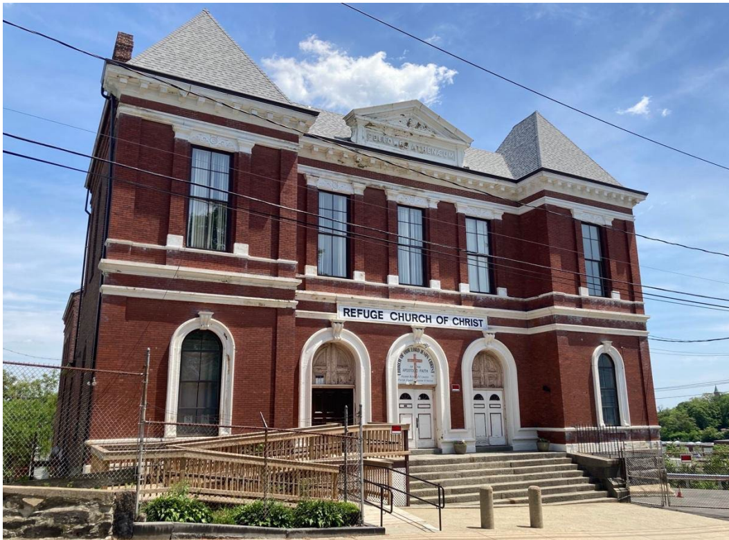
Figure 27: Fellows Athenaeum (today Refuge Church of Christ), 46 Millmont St, looking northeast.