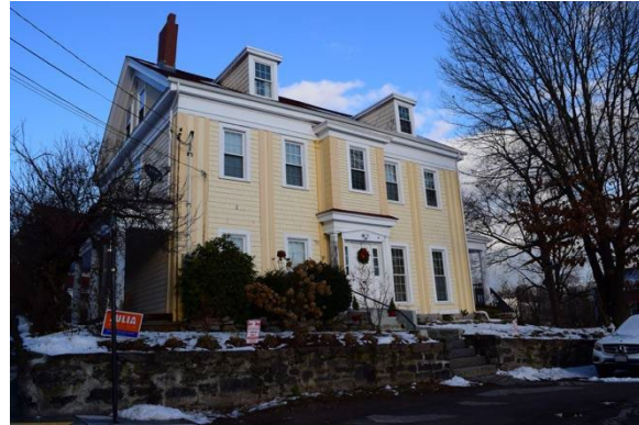
Figure 6: 1 Cedar Square, looking northeast.