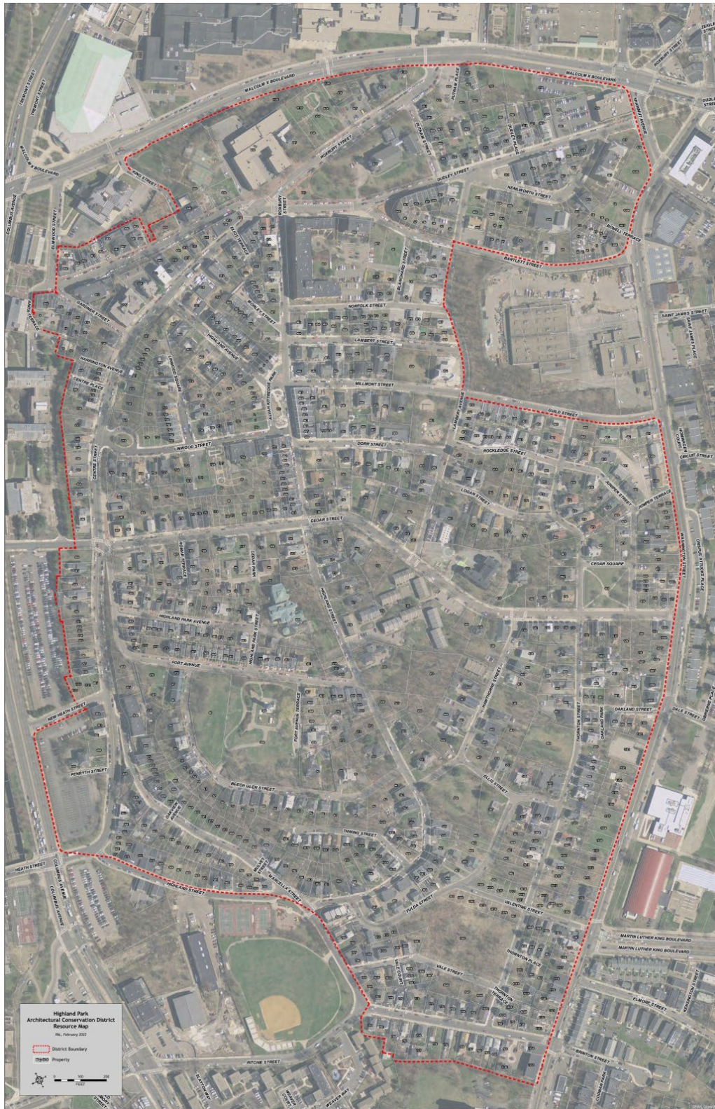
Figure 1: Highland Park Architectural Conservation District proposed boundary