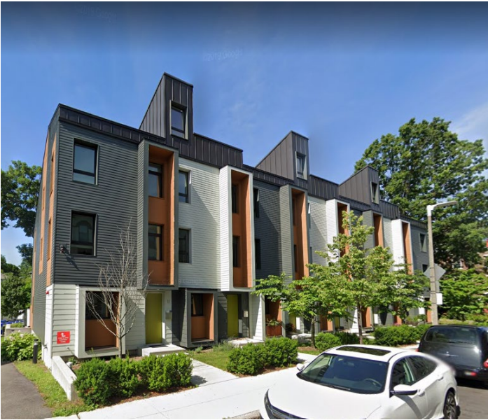
Figure 33: E+ houses on Dorr Street, looking southwest.