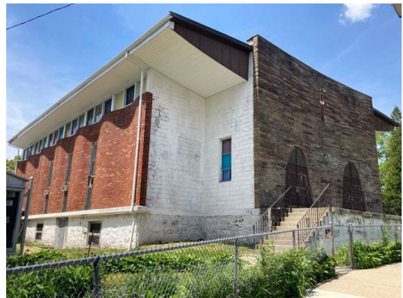
Figure 24: The Christ Temple Church of Personal Experience, 28-30 Kenilworth Street, looking southwest.

The three school buildings in the district were built with masonry construction in different styles in the late nineteenth and early twentieth centuries. The Dillaway School, 6 Kenilworth Street (1882, BOS.12102, Figure 20) was constructed in the Renaissance Revival style, with brick walls, a mansard