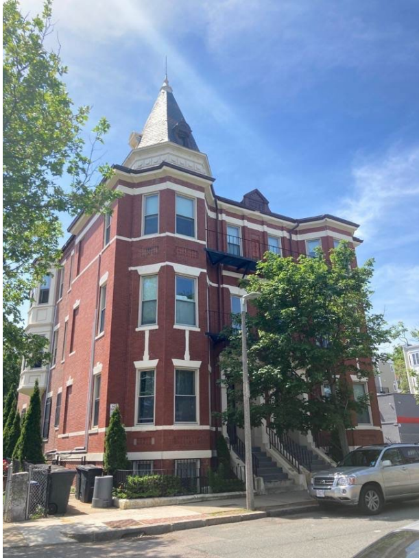
Figure 18: The Louis Prang Apartment House, 16–18 Centre Street, looking south.