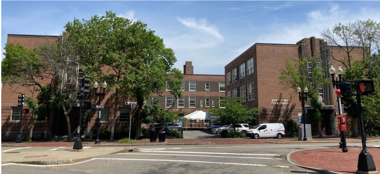
Figure 25: James P. Timilty Middle School on Roxbury Street, looking north.

roof with hip roof wings, a rusticated full-height center bay clad with limestone, and limestone moldings and surrounds. The Nathan Hale School, 51 Cedar Street (1908, BOS.11895) was built in the Colonial Revival style, with a cross-gable roof, brick walls with limestone belt courses, and segmental-arched entrances in projecting entry bays with gable parapet walls. The James P. Timilty School, 185–205 Roxbury Street (1937, BOS.12239, Figure 25) was built in the Art Deco style, with brick walls, vertical window groupings, and spandrels on the frontispiece of each wing. Other buildings have been informally used as schools, including Ionic Hall and the house at 27 Dudley Street, which were both informal community-run schools during the period when the Roxbury Action Program worked to develop Black self-determination and a model Black community.