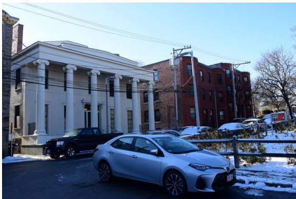
Figure 7: (L to R) Alvah Kittredge House (10 Linwood Street) and 20 Linwood Street, looking southwest.