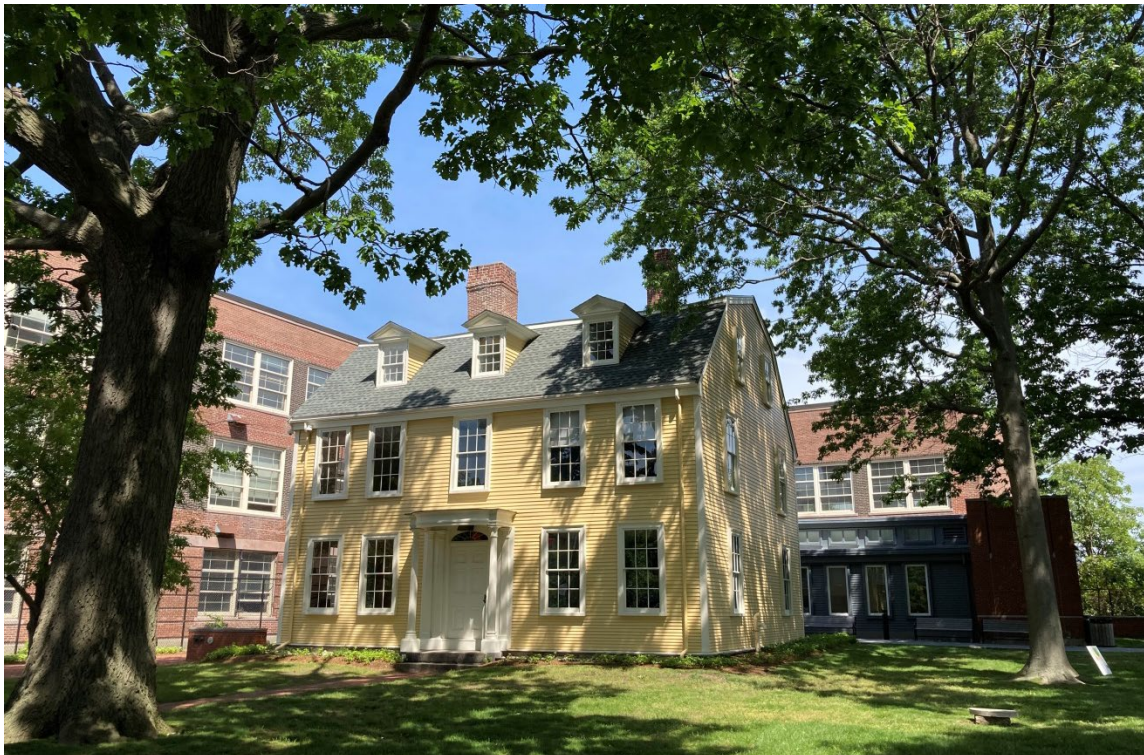
Figure 4: The Dillaway-Thomas House, looking northwest.

A small number of buildings in the district, located along Bartlett and Roxbury streets, are examples of wood-frame, single-family residences constructed in the Georgian and Federal styles. The oldest building in the district, the Dillaway-Thomas House, 183 Roxbury Street (1750–1754, NRDIS, BOS.11337, Figure 4) is the only Georgian-style building in the district, and is now within the Roxbury Heritage State Park, maintained by the Department of Conservation and Recreation. It is situated well back from the street edge at the north end of the district, and is identifiable by its five-bay-by-two-bay configuration, gambrel roof pierced by dormers, center entrance, and window placement right below the cornice. A small number of Federal style houses remain extant, such as the Spooner-Lambert House, 64 Bartlett Street (ca. 1780, NRDIS, BOS.11506) and Ionic Hall, 149 Roxbury Street (1800–1804, NRDIS, BOS.11503) , both of which are at the north end of the district. The Spooner-Lambert House retains its massing, fenestration, and chimney placement, as well as a balustrade surrounding the center of the roof. Ionic Hall has been altered to look Greek Revival by the addition of a third story but retains Federal-style massing and fenestration.