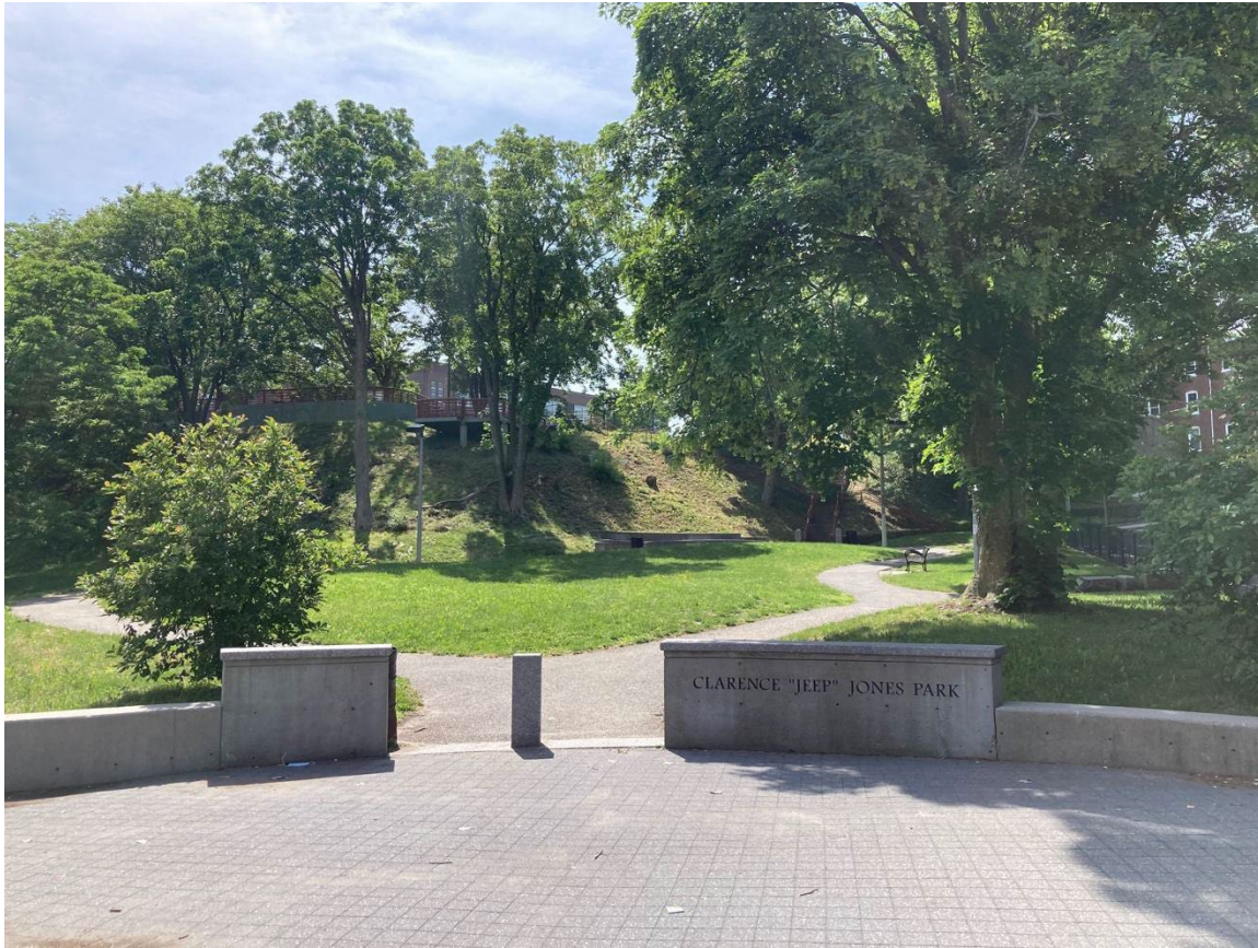
Figure 36: Jeep Jones Park, looking southeast.

Several vacant lots have been turned into pocket parks and/or community gardens, along with a small number of City of Boston-designated urban wilds, which are preserved remnants of historic Boston landscapes, and are minimally landscaped. Two urban wilds are within the district: the John Eliot Square Urban Wild at 42 Highland Avenue (conveyed by the City to Paige Academy in 2019), and the Rockledge Street Urban Wild, spanning approximately one third of the block between Logan Street and Rockledge Street. Community gardens include the Highland Avenue Community Garden, Thornton Street Community Garden and Urban Farm, Centre Place Garden, Highland Park 400 Garden, Cedar Street Garden I and II, Allan Crite Garden (Figure 37), and Margaret Wright Memorial Garden.