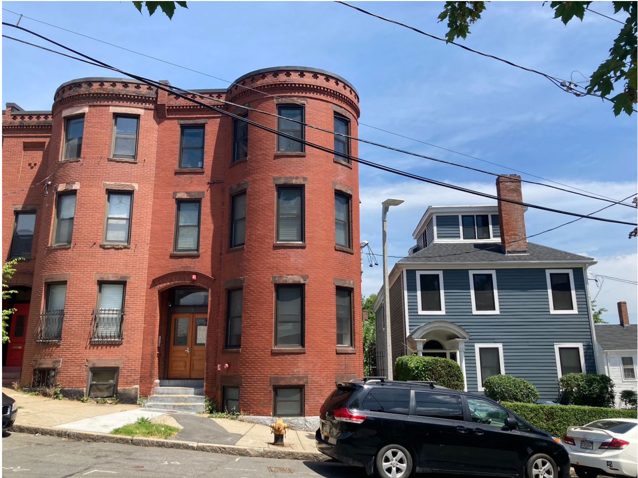
Figure 42: Highland Park is characterized by a variety of residential building types and scales, as seen here on Kenilworth Street.

With the exception of row houses, there is separation between many of the residential buildings in Highland Park that allows for a variety of side yard, driveway, and alley configurations. These spaces provide more access to light, air circulation, and views.