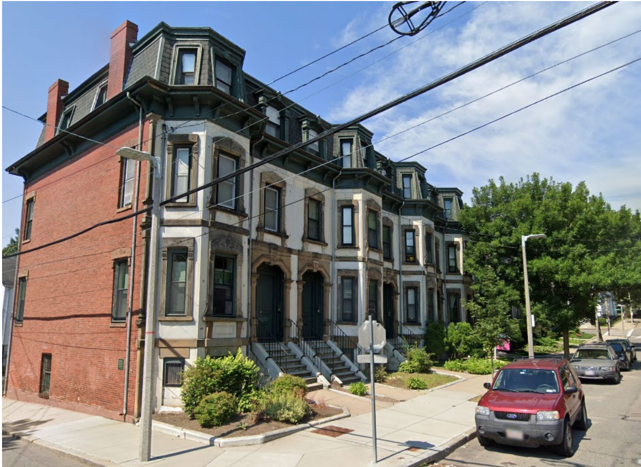
Figure 43: The Marble Block has setbacks which allow for green plantings in between the buildings and the sidewalk.