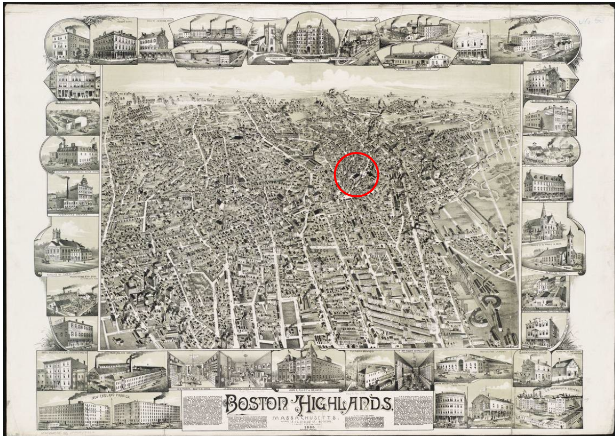
Figure 3: Entitled “Boston Highlands,” this bird’s eye view – created following Roxbury’s annexation to Boston – shows much of Roxbury looking toward the southwest. John Eliot Square is circled in red. O.H. Bailey & Co., Boston Highlands, Massachusetts: Wards 19, 20, 21 & 22 of Boston, 1888, 74 x 97 cm, Norman B. Leventhal Map Center, Boston.