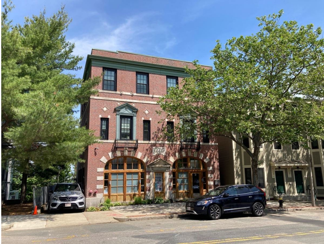
Figure 26: Engine 14 Fire House (today YouthBuild Boston), 27 Centre Street, looking north.