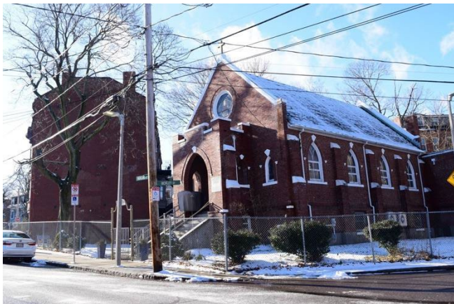
Figure 23: The Timothy Baptist Church at 35 Highland Street, looking southwest.