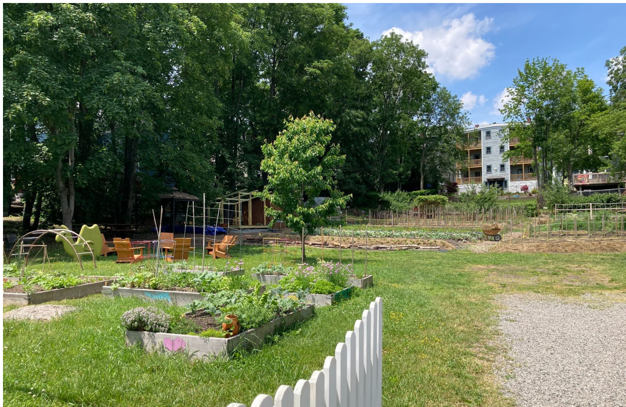
Figure 45: The Thornton Street Farm provides produce for a local cafe along with youth and family programming.

Highland Park's green spaces are highly valued by local residents as they function not only as sites to garden, socialize, or host neighborhood events, but also enhance the quality of life by providing a green, tranquil respite in the heart of the city. Recent studies have shown that communities of color are far more likely than others to suffer from inadequate tree cover that leads to excessive summer heat and other health problems. Highland Park's open spaces provide a healthy level of green space in the neighborhood, and they contribute to the improved wellbeing of the community.