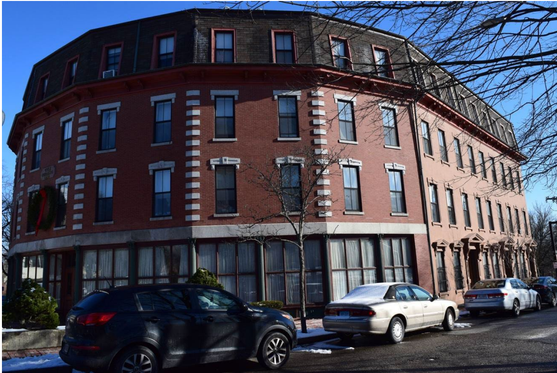
Figure 29: Cox Building, 1 and 3 John Eliot Square and 67, 69, and 71 Bartlett Street, looking east.

Mixed-use buildings are generally along main thoroughfares and have commercial space on the first story and residential units above. These buildings were constructed beginning in the middle of the nineteenth century and include the Second Empire-style, brick Cox Building, 1-3 John Eliot Square (ca. 1870, NRDIS, BOS.11505, Figure 29) , which faces Dudley Street, Eliot Square, and Bartlett Street, and is currently used as offices and low-income housing; and the Italianate-style, wood-frame building at 80-82 Marcella Street (1890, BOS.12192) , which has a convenience store on the first story and apartments above.