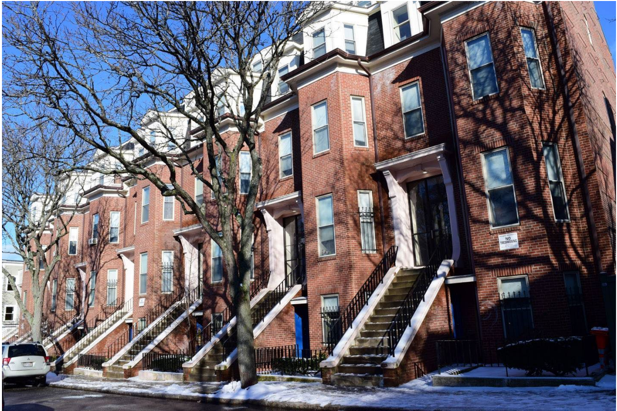
Figure 40: 15, 17, 19, 21, 23, 25, and 27 Highland Avenue, looking northwest.

Streets south of the park, including Beech Glen and Thwing, typically have buildings only on the south side of the street or only a small number of houses near intersections on the north side, and are wooded, in the case of Thwing Street, or abut Highland Park, in the case of Beech Glen Street, as a result of the steep slope making it harder to build into the upward ascent of the land. Both streets are generally built out with closely-set, wood-frame three-deckers, as on Beech Glen Street (Figure 13), or single-family, wood-frame houses, as on Thwing Street (Figure 10). Streets with houses concentrated on one side generally have sidewalks only on the side adjacent to the houses, and are often short, curving streets, some ending in dead ends, like Thwing Street, and some connecting to larger through-streets, like Beech Glen Street.