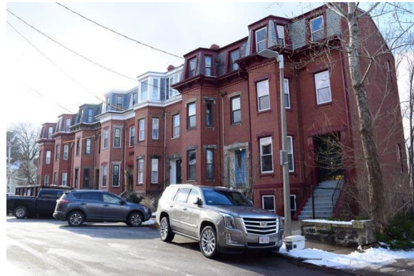
Figure 39: (L to R) 2, 4, 6, 8, 10, 12, and 14 Linwood Street, looking southwest.