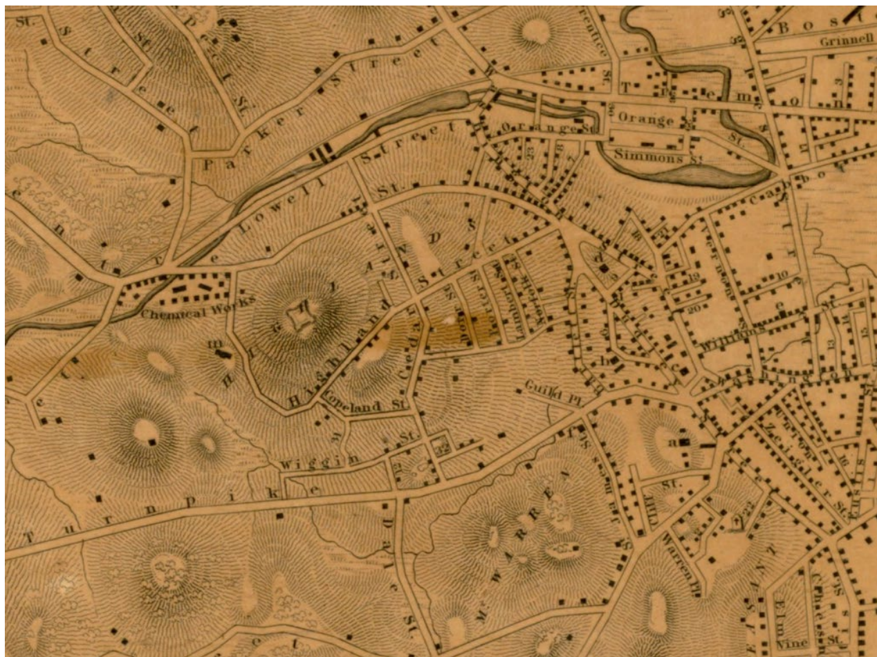
Figure 2: This excerpt from an 1843 map of Roxbury shows the Highland Park area labeled as “Highlands.” Charles Whitney, engraved by G.W. Boynton, Map of the town of Roxbury: surveyed by the order of the town authorities, 1843, 43 x 80 cm, Norman B. Leventhal Map Center, Boston.

Historically, the area was often referred to as the “Highlands” or the “Roxbury Highlands.” The 1843 map of the Town of Roxbury (see Figure 2) shows the study area labeled as “Highlands.”