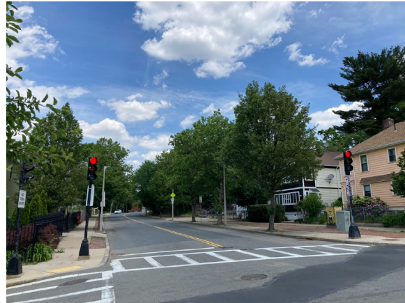
Figure 44: Trees in parks (such as Cedar Square Park, above left), along streets (such as Centre Street, above right), and in yards provide greenery, shade, and beauty for the neighborhood.