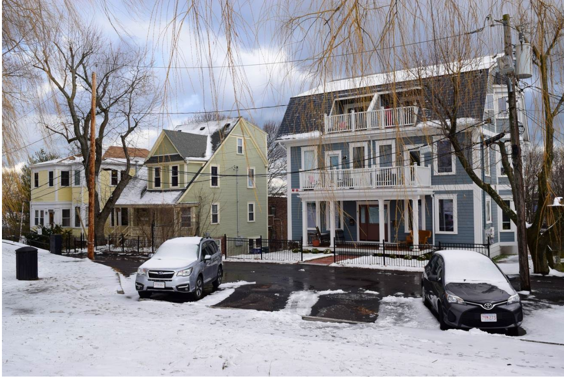
Figure 31: (L to R) 2, 3 and 4 Fort Avenue Terrace, looking northeast.