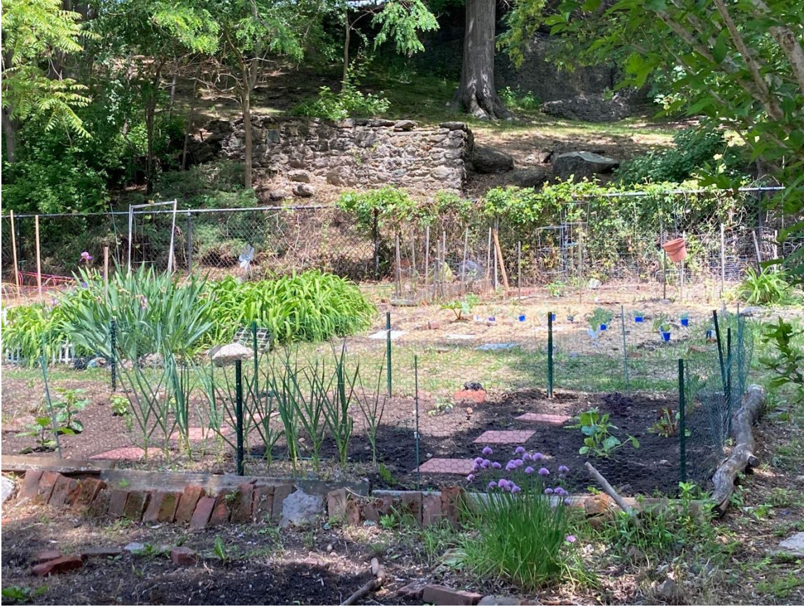
Figure 37: The Allan Crite Community Garden on Cedar Street, looking northeast. A stone wall can be seen in the background.