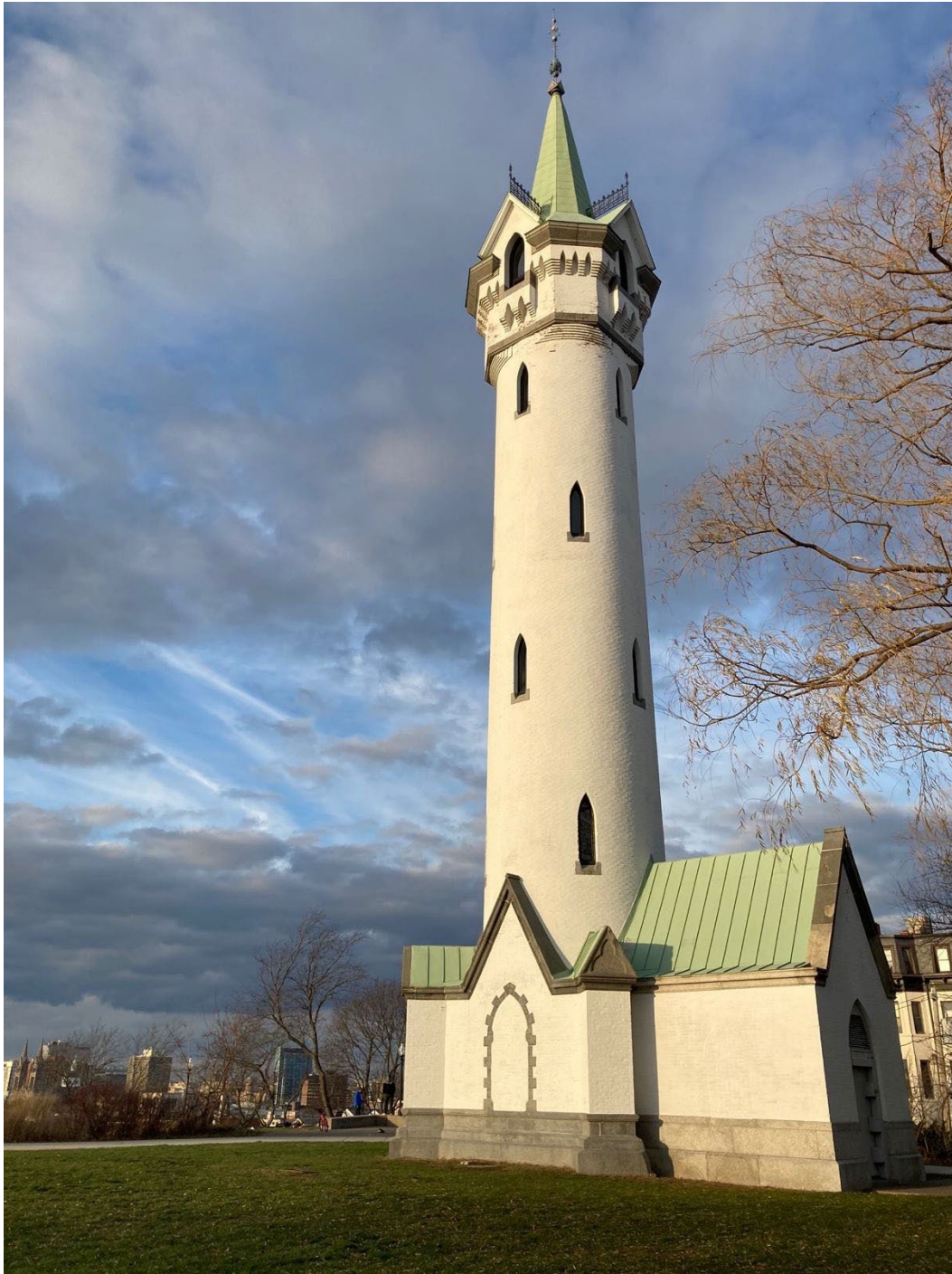
Figure 28: Cochituate Standpipe in Highland Park, looking southeast.

The most readily apparent non-residential structure in the district is the Cochituate Standpipe (1869, NRIND, BOS.9408, Figure 28), a 70-ft-tall, Gothic Revival-style, columnar brick water tower with a conical roof. Designed by Nathaniel Bradlee, the standpipe was constructed to hold water and provide gravitational pressure to the Roxbury portion of Boston's water system. The standpipe was quickly obsolete as the water system improved, but it remained in place, and the surrounding open space was subsequently landscaped into park land (discussed below).