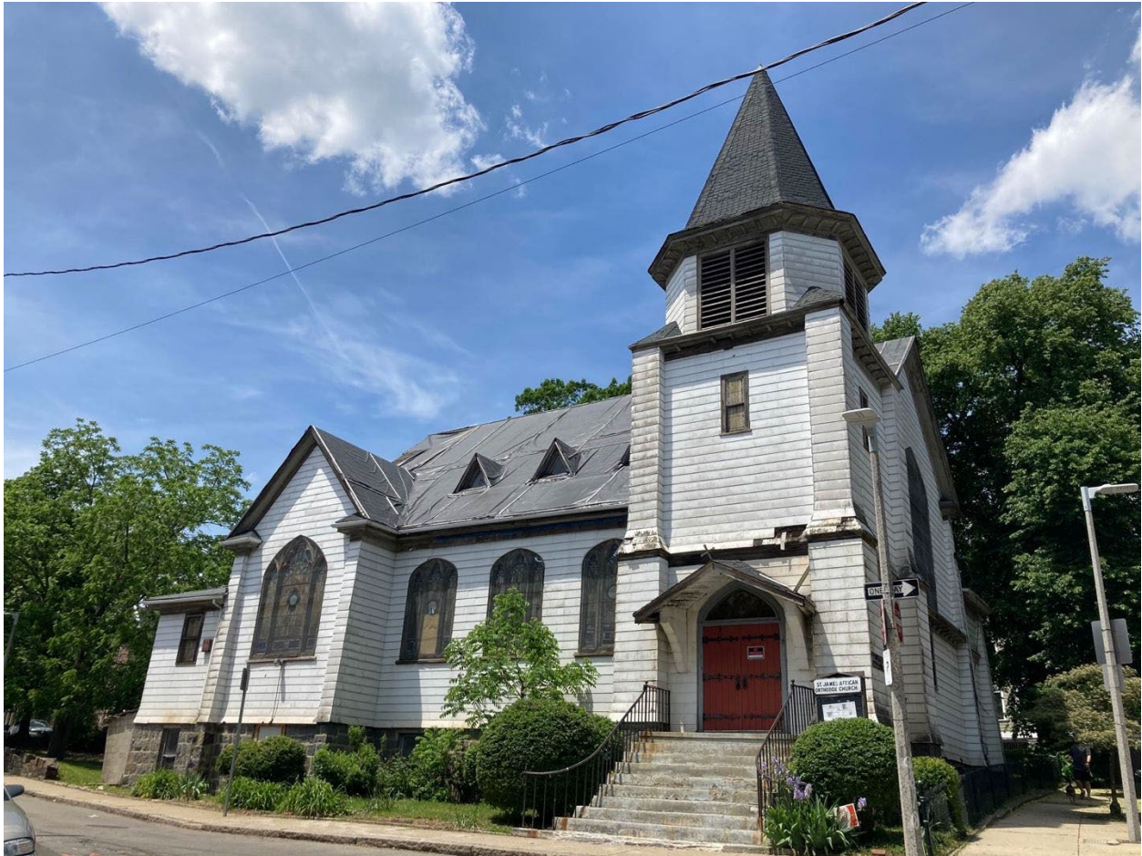
Figure 22: The St. James African Orthodox Church (50 Cedar Street), looking west.