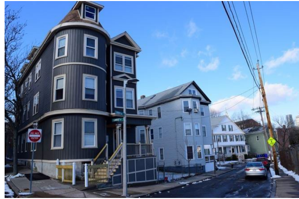
Figure 14: (L to R) 27, 25, 23, 17, 19 and 5 Lambert Avenue, looking northwest.