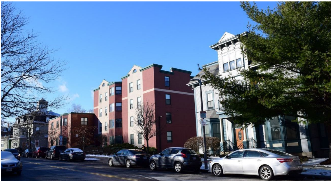
Figure 9: (R to L) 29, 45, and 47 Centre Street, looking southwest.

The Second Empire style, which came into popularity about 1855, is identifiable by its rectangular form and mansard roof. It was used for small cottages, like the two-and-one-half-story building at 85 Thornton Street (by 1858, BOS.12577) and the twin one-and-one-half-story buildings at 11 and 13 Valentine Street (ca. 1870, BOS.12631, 12632) , and larger, ornate houses, like the two-and-one-half-story Louis Prang House, 47 Centre Street (1856, BOS.11932, Figure 9) , with its shallow, bracketed mansard roof, recessed entrance, and rectangular massing. As with the Greek Revival and Italianate styles, Second Empire buildings in the district are configured with both center-entry and side-hall plans.