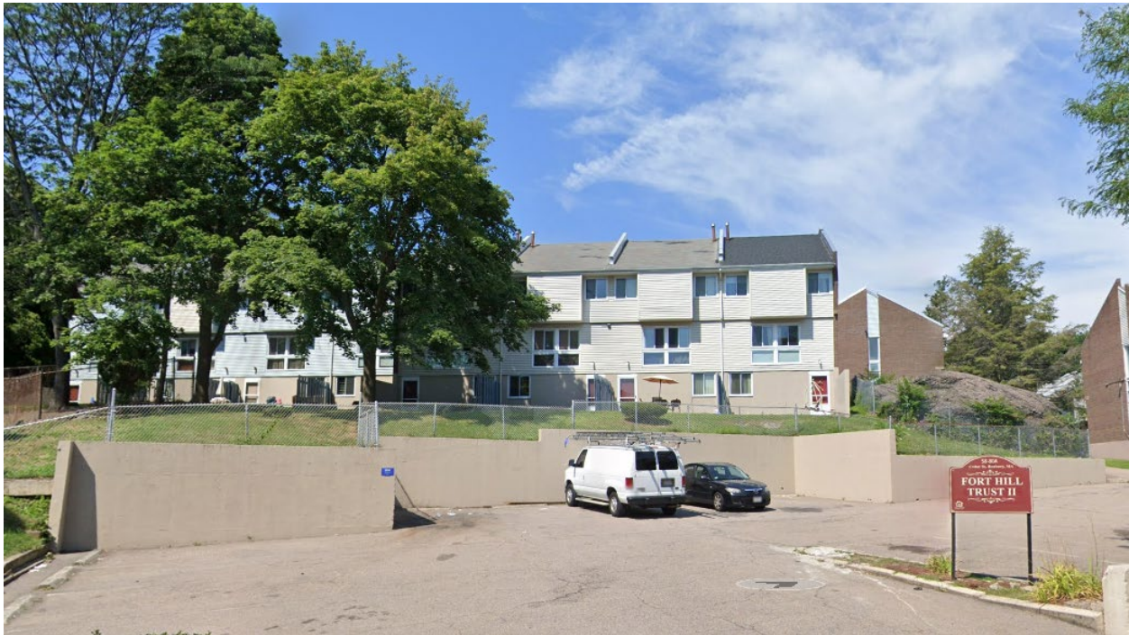
Figure 35: The Fort Hill Trust Apartments at 58 Cedar Street, looking west.

Marcella, and Lambert Streets, and the Fort Hill Trust Apartments located on Cedar, Highland, and Hawthorne Streets. 27