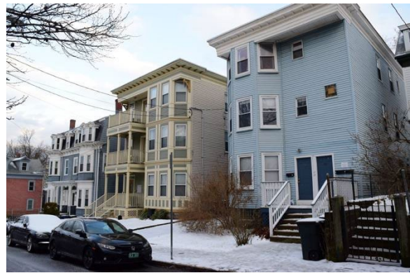
Figure 16: (L to R) 102, 108, 110, 112 and 114-116 Thornton Street, looking northeast.

Apartment buildings came into favor in the late nineteenth century and were constructed in two major forms: flat facades or undulating facades that mimic row houses. They were built in popular styles like Classical Revival and Colonial Revival. Buildings in the district with flat facades built around the turn of the century include the Classical Revival-style 288-300 Roxbury Street (ca. 1895-1906, BOS. 12658, Figure 17) and 50-70 Highland Street (1899-1900, BOS.12061) .