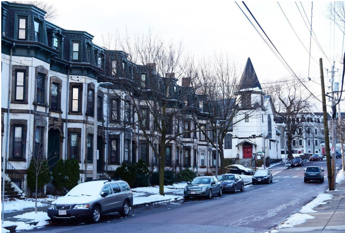
Figure 11: The Marble Block (L to R: 28, 30, 32, 34, 36, 38, 40, 42, and 44 Cedar Street) and St. James African Orthodox Church (50 Cedar Street), looking west.

Row houses are generally built of brick with shared party walls, frequently topped with mansard roofs, and are built near the street edge. Among the most ornate row houses in the district is the Marble Block, 28-44 Cedar Street (1871, Figure 11) , built by George D. Cox, consisting of a row of mansard-roofed brick houses faced with marble. On Fort Avenue are the brownstone-faced row houses at 19-31 Fort Avenue (ca. 1858-1873, BOS.11972) . Row houses are also found on Highland and Highland Park Avenues, Kittredge Park, Centre Place, and Beech Glen and Morley Streets. One pair of row houses at 49-51 Fort Avenue (ca. 1873-1884, BOS.11974) was constructed in the Italianate style.