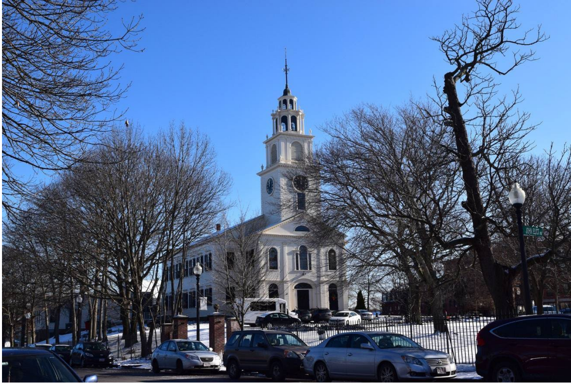
Figure 21: First Church in Roxbury (160 Roxbury Street), looking east.