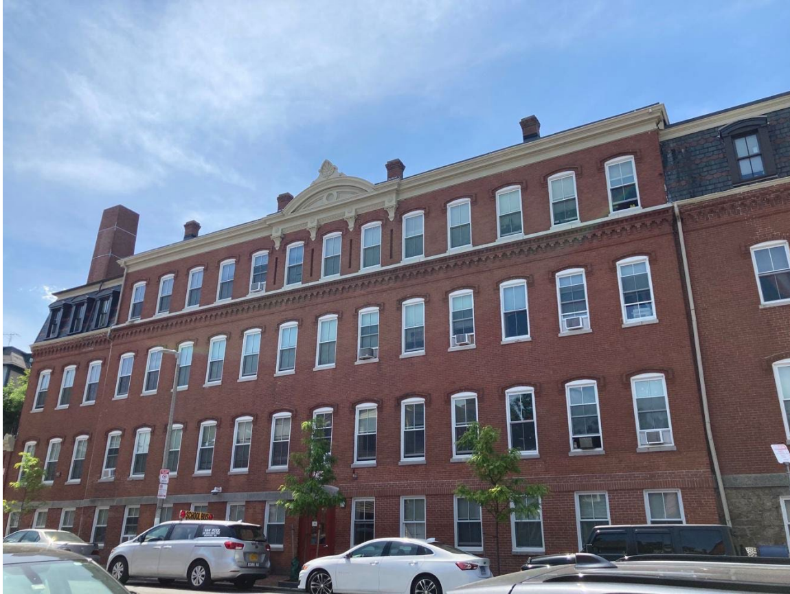
Figure 30: Apartments at the former Louis Prang Chromolithograph Factory, 270–286 Roxbury Street, looking south.