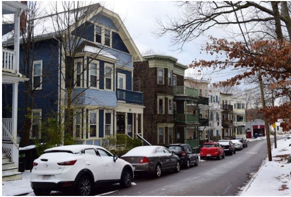
Figure 13: (L to R) 55, 53, 51, 49, 47, 45 and 43 Beech Glen Street, looking west.